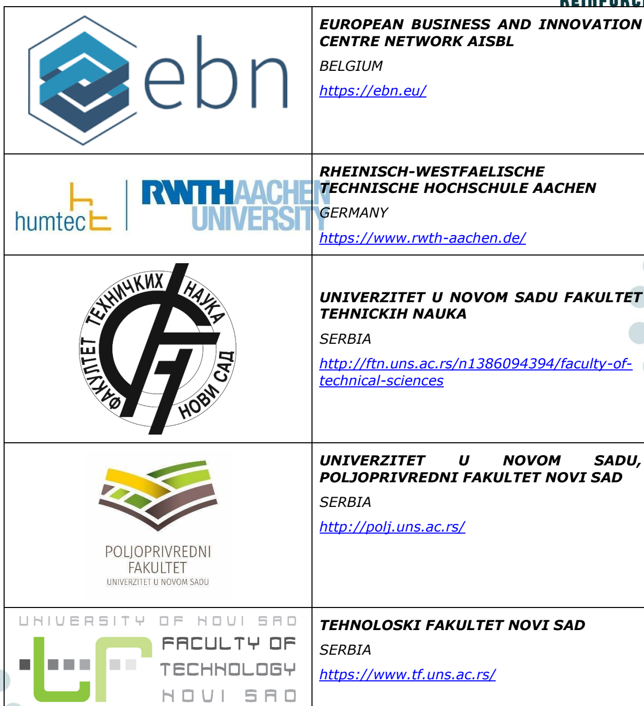
Table 2: REINFORCING partners